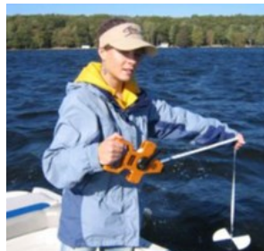
Water Quality - LOLA Seasonal Water