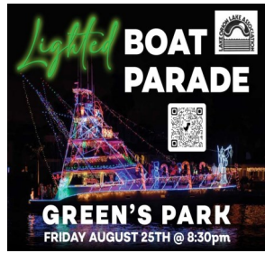
Lighted Boat Parade 2023 Winners